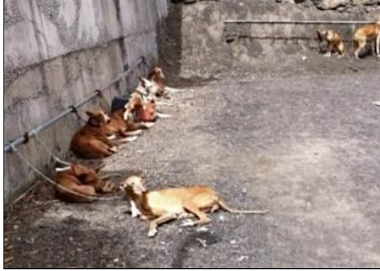
Podencos in the Azores.

Portuguese Kennel Club." And yet, the podenco in Portugal is seen mainly as a utilitarian, working animal and kept in extremely harsh conditions. Greyhound Friends is helping inform the public about the podenco breed, alongside other animal welfare organizations striving to