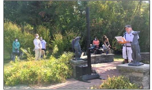
May 2020 Remembrance Ceremony

As is our Open House custom, we will hold a Remembrance Ceremony in our beautiful Memorial Garden.