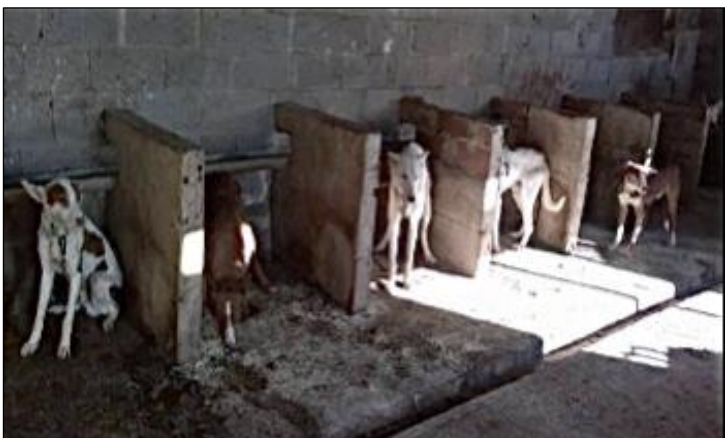
Podencos in the Azores . Photo courtesy of Bring Portuguese Podencos to Light

Here’s how the Podenco Alliance, formed to alleviate the suffering of podencos and other hunting dogs in Spain, describes the breed: “As well as being athletic, resilient, clever, independent and noble dogs; by nature podencos are also funny and cheeky, naturally tactile and so loving. But above all they are sensitive, caring... souls like no other.”