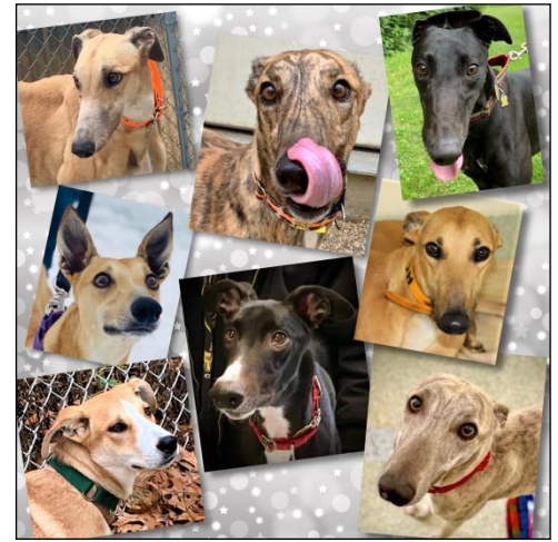
More of our recent adoptions.

We have also made connections with Sugarfoot Farm Rescue in Kentucky, where adoption demand is not as strong as in New England, even during the pandemic. Spay/neuter practices are less common there, leading to a glut of unwanted dogs. Our collaboration has brought in some healthy, happy mixed-breed dogs who were adopted very quickly into loving households.