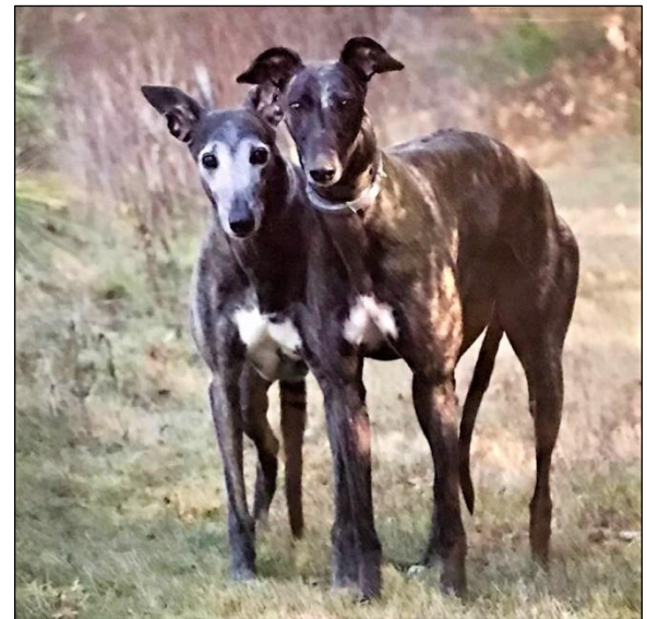
Shona and Sugar Rae.

had no previous socialization. She cannot get to me fast enough. I hear her running down my hallway and it sounds like thunder in the clouds. However, I don’t think that Shona and Sugar Rae know that they are related.