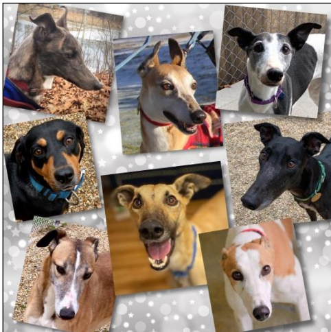
A few of our recent adoptions.

Greyhound racing has ended in Florida, which has virtually halted the flow of domestic racing greyhounds for adoption in Massachusetts. During the past year we have been working on developing collaborations with other adoption groups