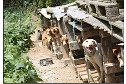
Podencos in the Azores.

Want to help? Please spread the word, follow us for updates, and if you can, please send a donation to support this important work. We cannot do it without you.