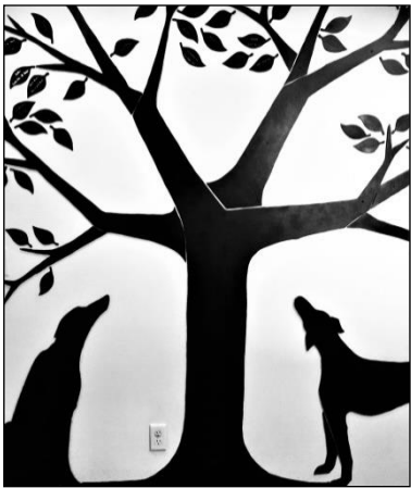
This beautiful Tree of Life honoring special friends greets visitors in our reception area.

greater greyhound community; to advocate for the humane treatment of all animals; and to educate the public about greyhounds and their sighthound cousins everywhere. As always, we honor our commitment to rehome any greyhound in need, and we have taken in and rehomed several older and “special needs” greyhounds this past year.