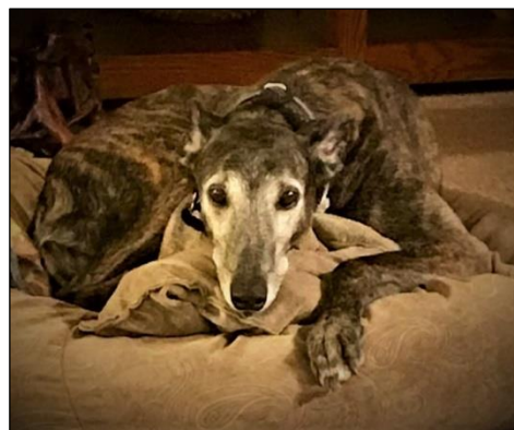
Shona, being perfect

I consider all my dogs to be a huge blessing in my life. They have added meaning and so much love. Shona will turn 12 this April. As always, I am hoping for the best.